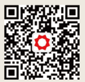
Scan this QR Code or search "SCE1966HK" in WeChat for the latest Company information